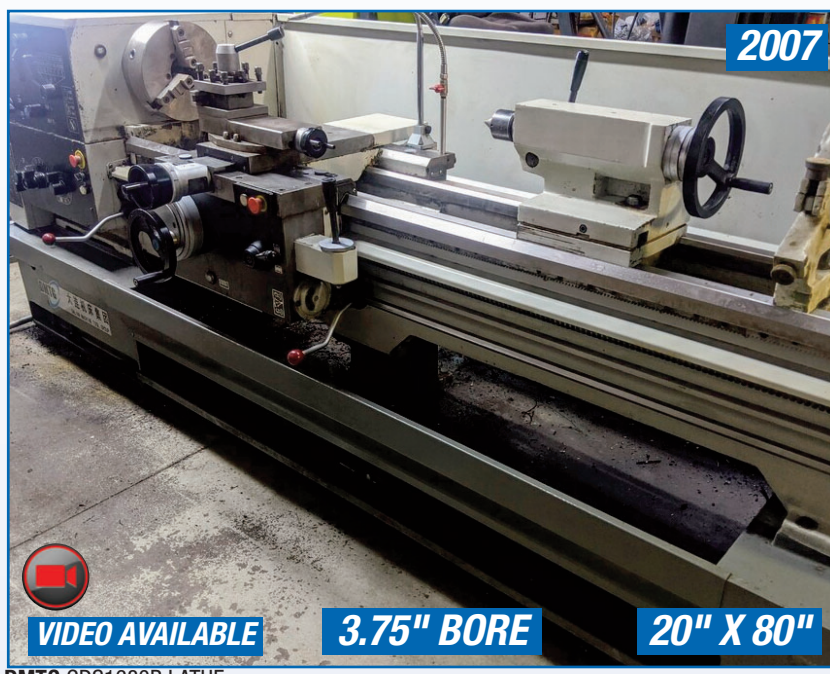
DMTG CDS1680B LATH