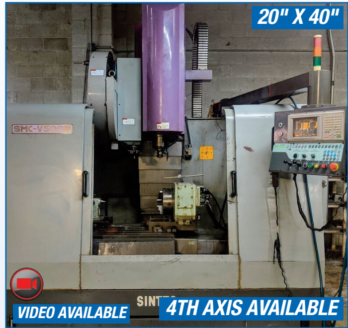
SINTEC SMC-V500M CNC VERTICAL MACHINING CENTER