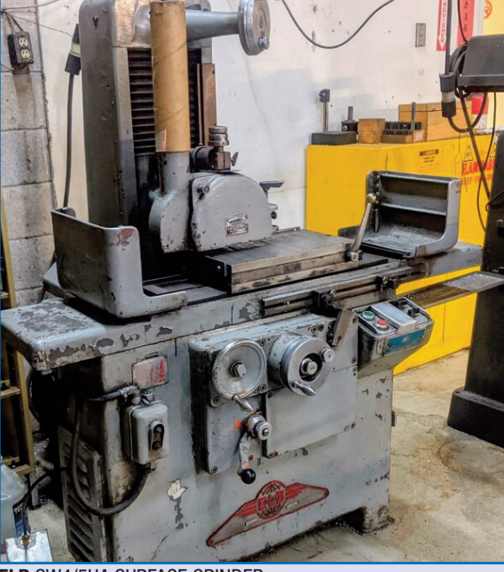
ELB SW4/5HA SURFACE GRINDER

2015 KBC TUM-3VS CNC Vertical Mill, Acu-Rite G2 CNC Control, R8, 10" x 54" Table, 3HP, 60-4,200 RPM, Heavy-Duty Box, Quill Release Featured on Z-Axis, One-Shot Lubrication System, Front/Rear Way Covers, Cross Travel w/ CNC Control 12", Longitudinal Travel (Manual) 32", Quill Travel w/ CNC Control 4", Z-Axis Travel 16", Longitudinal Travel w/ CNC Control 28", Table to Spindle 0-16-5/8", s/n 150085