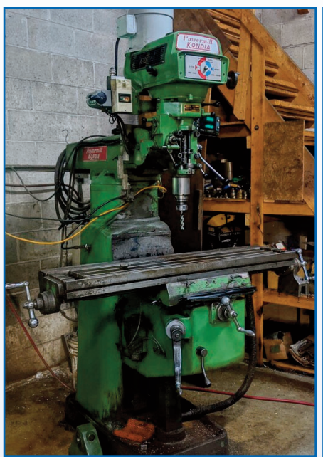
POWERMILL KONDIA FV-1 VERTICAL MILL