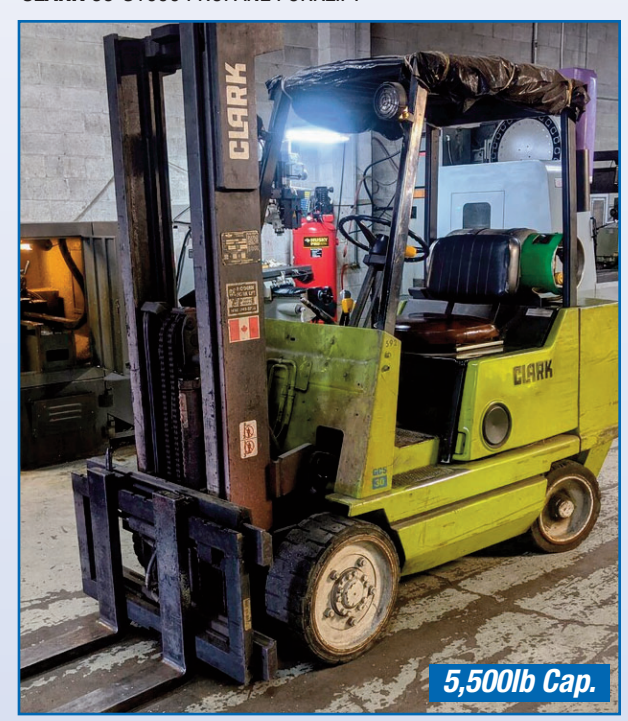
CLARK GCS30MB PROPANE FORKLIFT