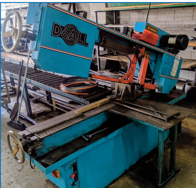
DOALL C-916M HORIZONTAL BANDSAW