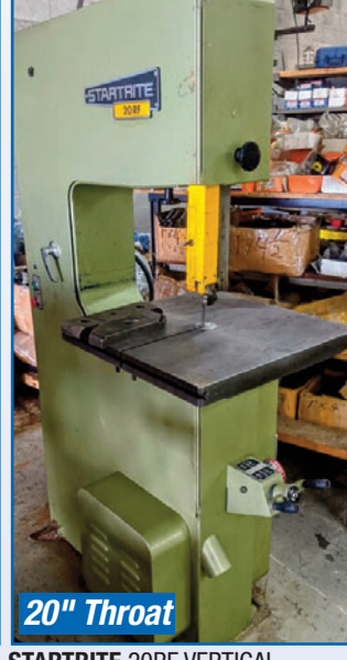
STARTRITE 20RF VERTICAL BANDSAW