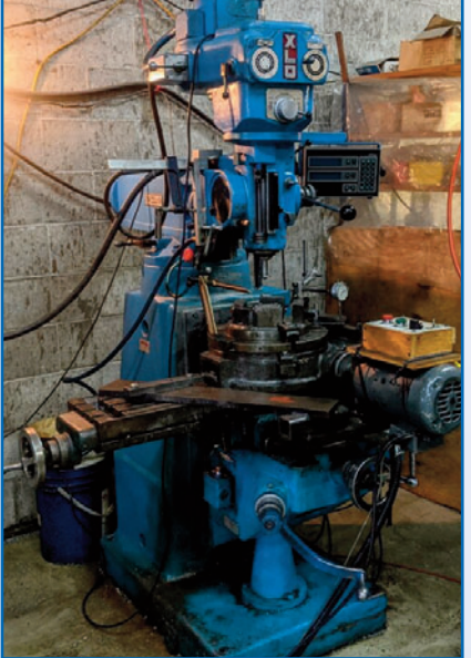
EX-CELL-0 602 VERTICAL MILL