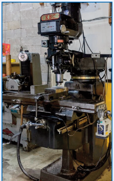
KBC VERTICAL MILL