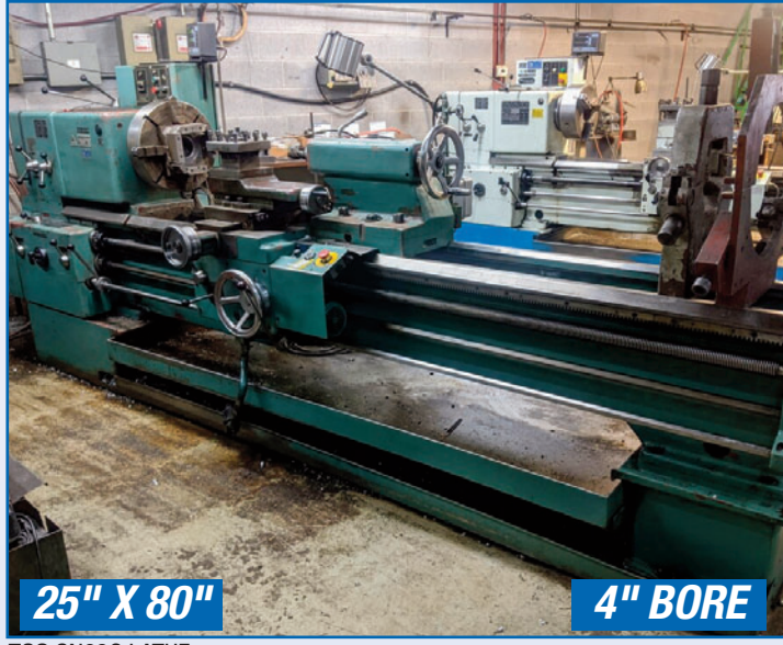
TOS SN63C LATHE