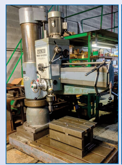
FEMCO WRD 50/1250 RADIAL ARM DRILL