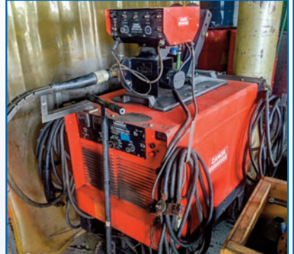
CANOX ULTRAWELD 400 WELDER W/ WIRE FEEDER