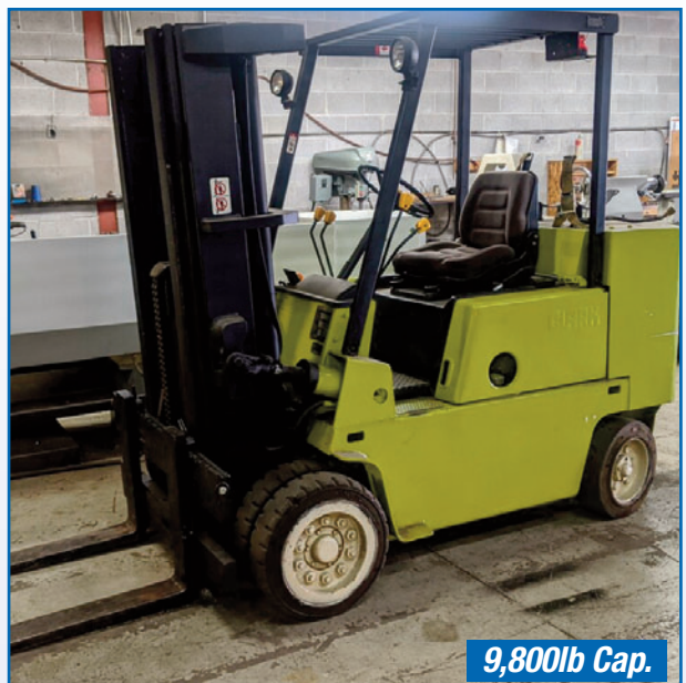
CLARK C5-S1000 PROPANE FORKLIFT